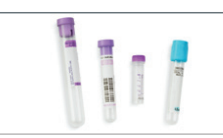
1. Use the appropriate tube (EDTA for canine, feline or equine blood, and sodium citrate for bovine blood).