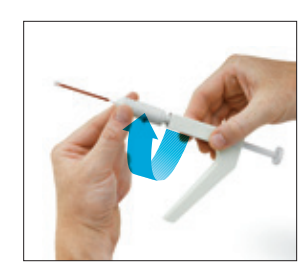
5. Hold the pipettor horizontally and unlock the barrel by twisting it clockwise. Gently remove the tube.