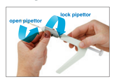
1. With the nozzle pointing away from you, unlock the pipettor by twisting the barrel clockwise. Insert the tube end with green lines into the barrel. Lock it in place by twisting the barrel counterclockwise.