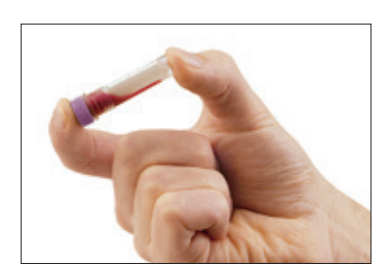
2. If the sample sits between transfer into the EDTA tube and drawing into the IDEXX VetTube, gently invert the tube for 30 seconds (at least 10 times) to mix. For bovine samples, refer to the bovine-specific sample preparation kit.